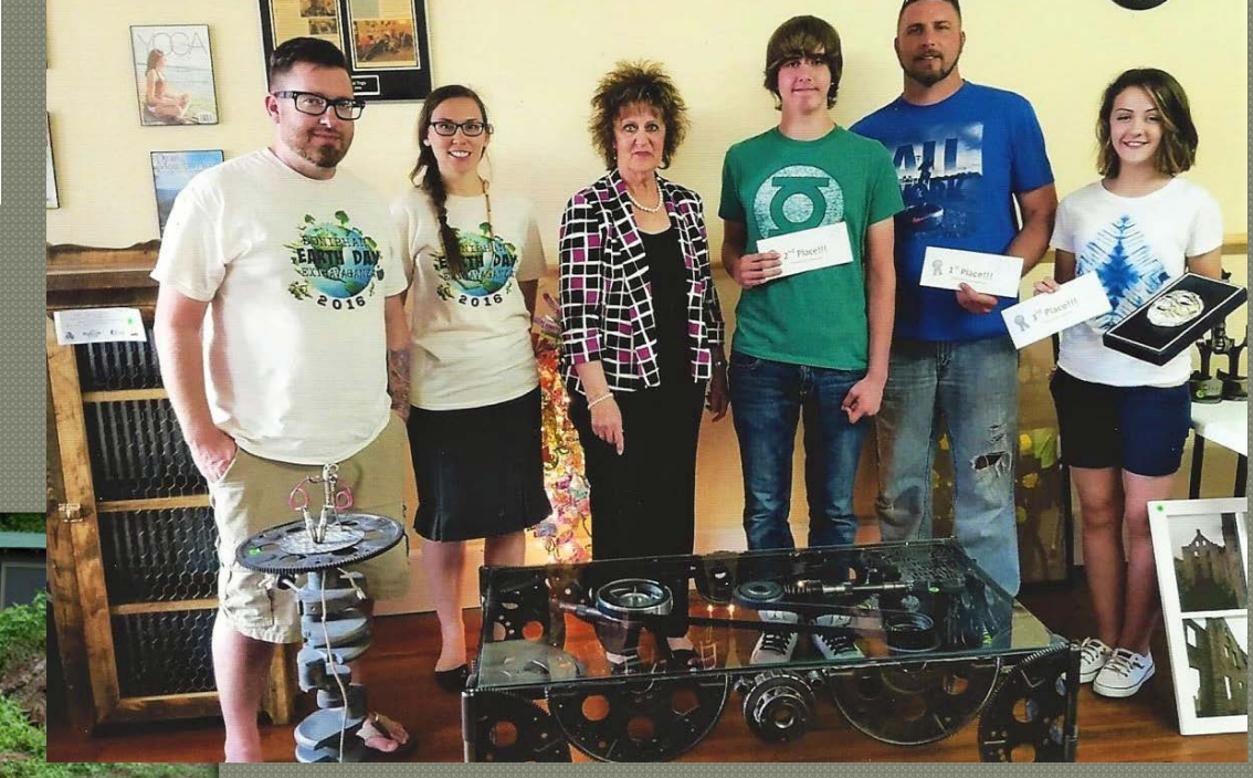
Recycled Art Contest April 2016